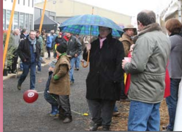
The crowds at Sheepvention 2011.